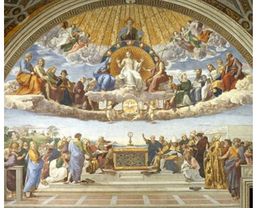
Disputation of the Holy Sacrament ~ Raphael ~ Fresco ~ 1509-10 ~ Vatican Museums Jesus said to the people, "I am the living bread that came down from heaven. Whoever eats of this bread will live forever; and the bread that I will give for the life of the world is my flesh." John 6:51

Diocese of Ottawa. The Anglican Church of Canada The Guards' Chapel