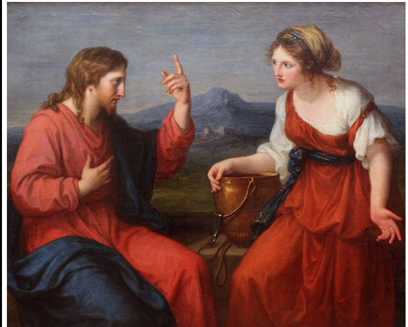
Christ & The Samaritan Woman - Angelika Kauffman - 1796 - Neue Pinakothek Museum, Munich Jesus said to her, "Everyone who drinks of this water will be thirsty again, but those who drink of the water that I will give them will never be thirsty. John 4:13-14