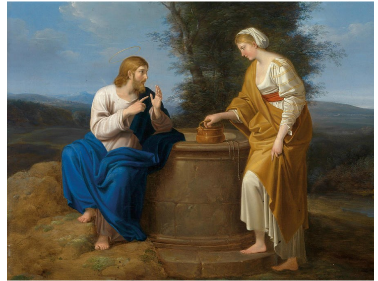
Christ and the Samaritan Woman at the Well ~ Ferdinand Georg Waldmüller ~ 1818

The Church of St. Bartholomew Diocese of Ottawa. The Anglican Church of Canada The Guards' Chapel