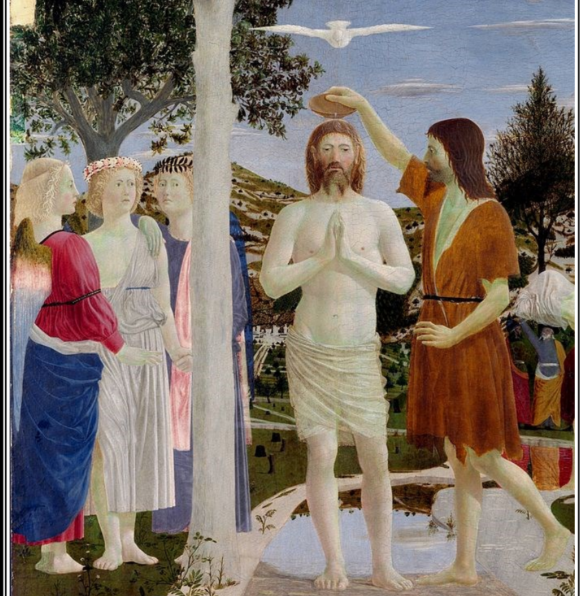
Baptism of Christ ~ Piero della Francesca c. 1450, National Gallery, London And when Jesus had been baptized, just as he came up from the water, suddenly the heavens were opened to him and he saw the Spirit of God descending like a dove and alighting on him. Matthew 3:16