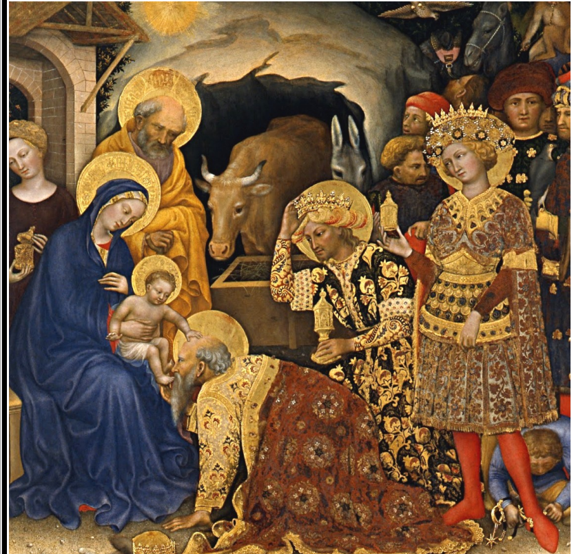
Adoration of the Magi - Gentile da Fabriano, 1423 Uffizi Gallery, Florence Then, opening their treasure chests, they offered him gifts of gold, frankincense, & myrrh. And having been warned in a dream not to return to Herod, they left for their own country by another road. (Matthew 2:1-12)

Diocese of Ottawa. The Anglican Church of Canada The Guards' Chapel